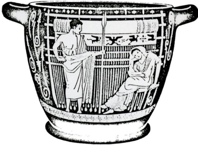
Fig. 29. Telemachus and Penelope with warp-weighted loom on an Attic bowl from Chiusi (ca. 440 B.C.).