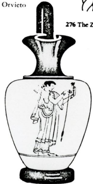
Fig. 15. Woman spinning and holding a distaff (Attic winejar, 480 B.C.)