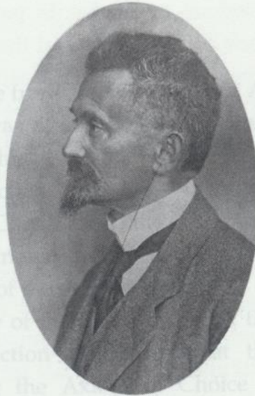
FELIX HAUSDORFF 1868 – 1942