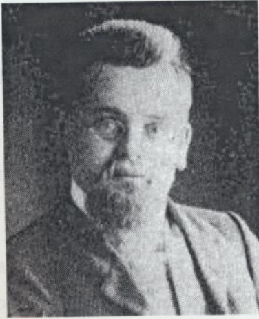
ERNST ZERMELO 1871 – 1953